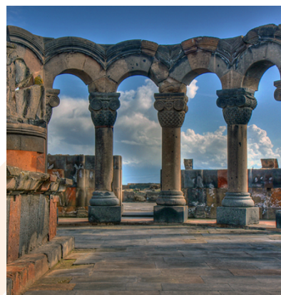
The Temple of Zvartnots