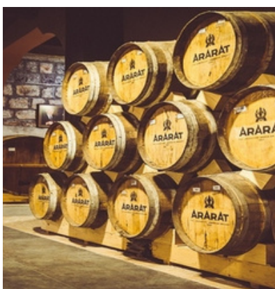
Brandy Factory and museum