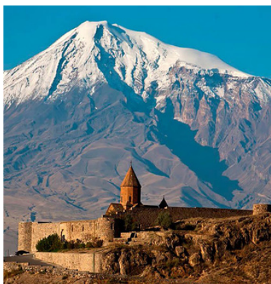
Khor Virap Monastery