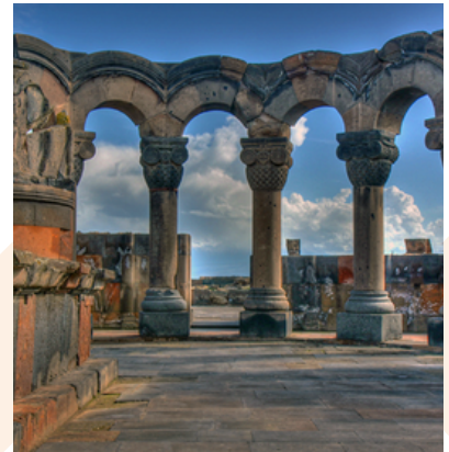
The temple of Zvartnots