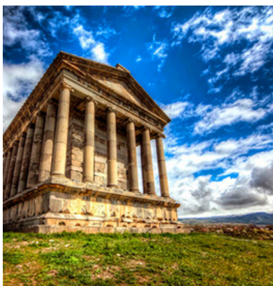
The Temple of Garni