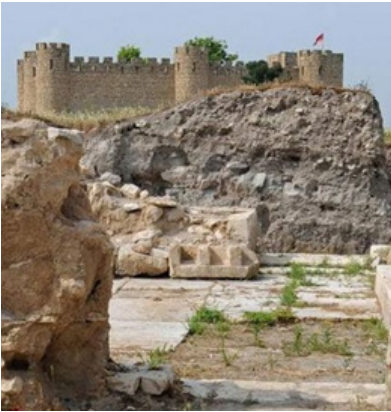
Ancient capital Dvin