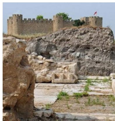
Ancient capital Dvin