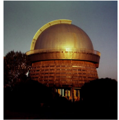
Byurakan Astrophysical Observatory